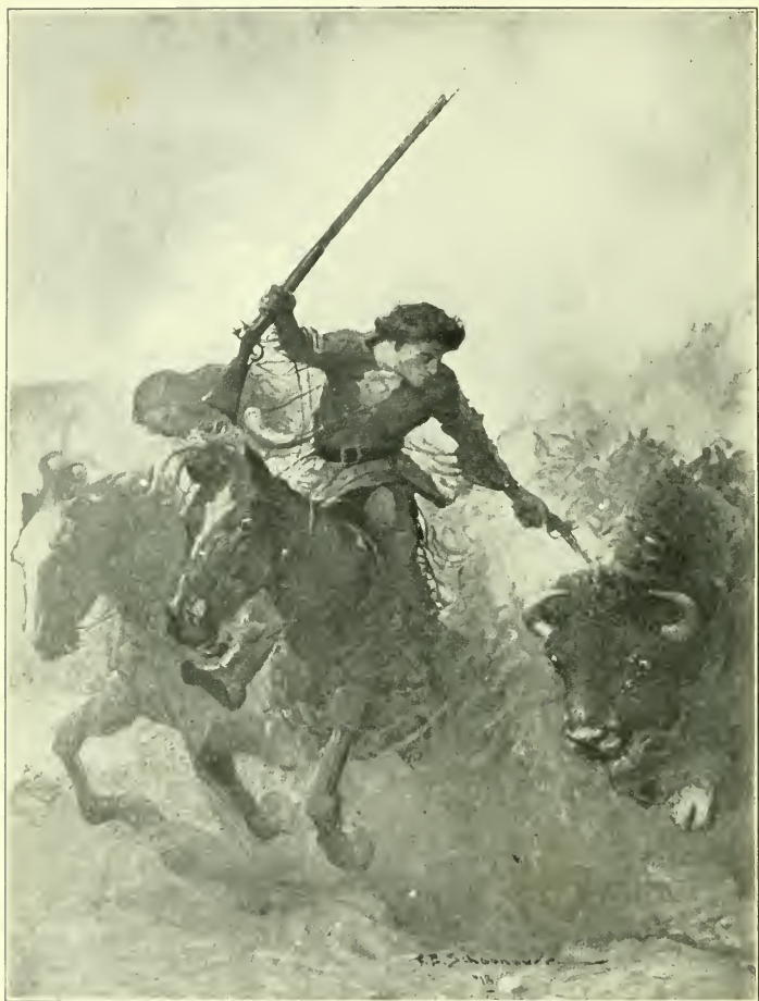
I LEANED OUT AND FIRED STRAIGHT AT A BIG HEAD (p. 105)